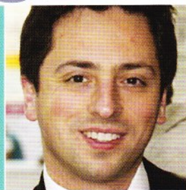
Sergey Brin, Google Co-Founder