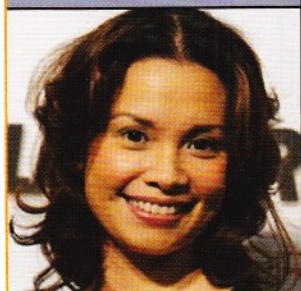
Lea Salonga, Tony Award Winning Actor