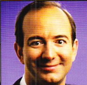
Jeff Bezos, Amazon.com Founder