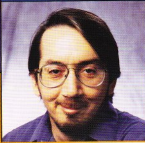
Will Wright Designer of SimCity